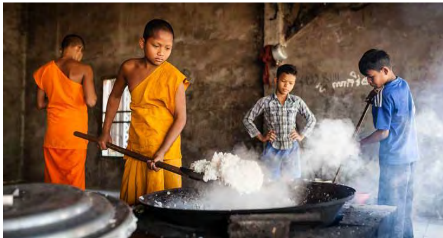
THE DAILY LIFE OF BUDDHIST MONKS IN TRANQUIL MONASTERIES