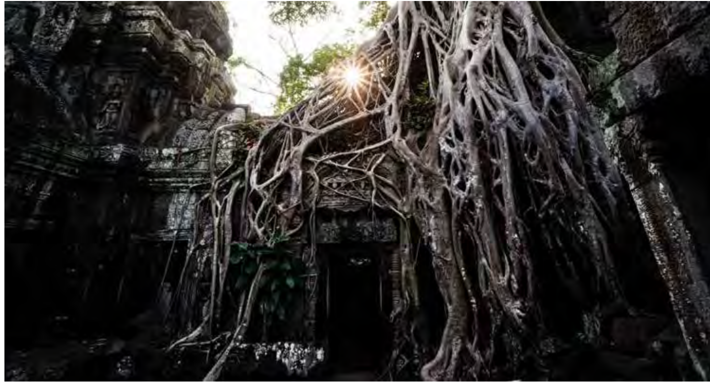
THE TEMPLES OF ANGKOR AND ALL THEIR SECRETS