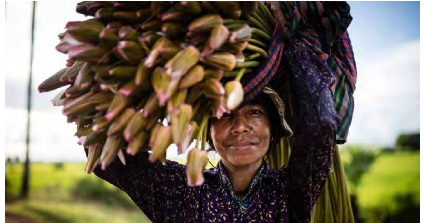
REAL CAMBODIAN PEOPLE GOING ABOUT THEIR DAILY ACTIVITIES: MARKETS, COUNTRYSIDE, AND MORE